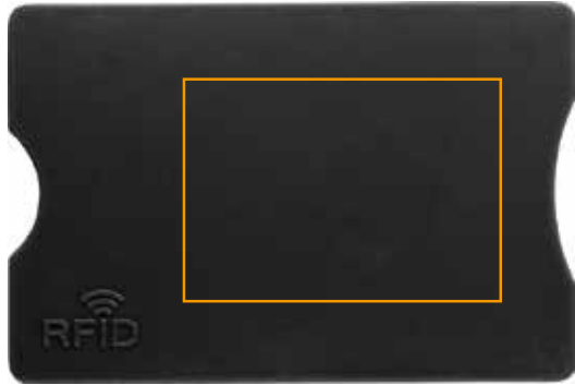
1. FRONT SIDE