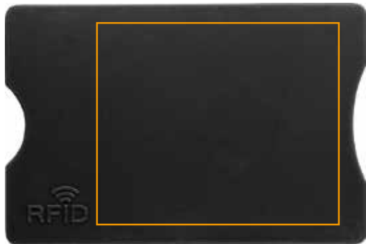
3. FRONT SIDE