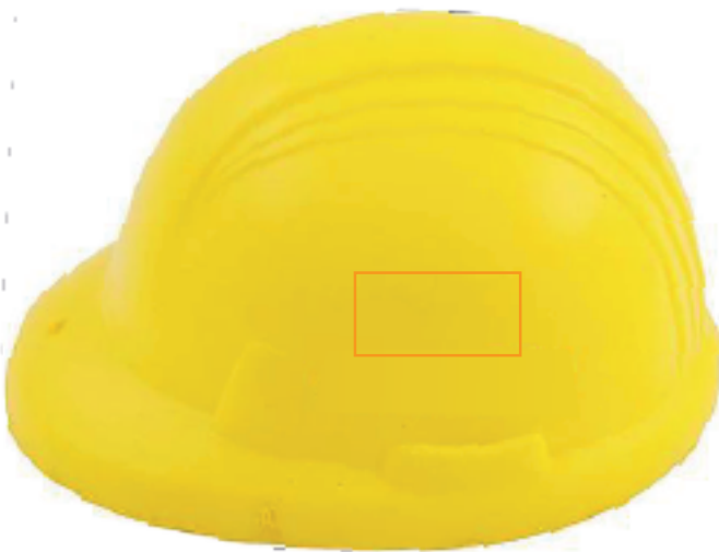
3. AT THE SIDE