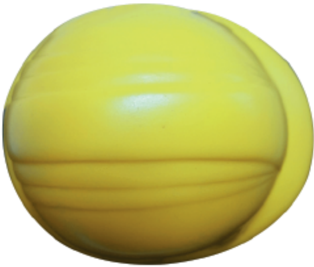
1. TOP SIDE