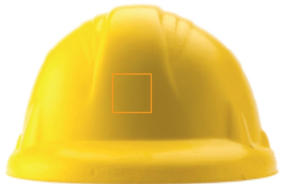
4. FRONT SIDE