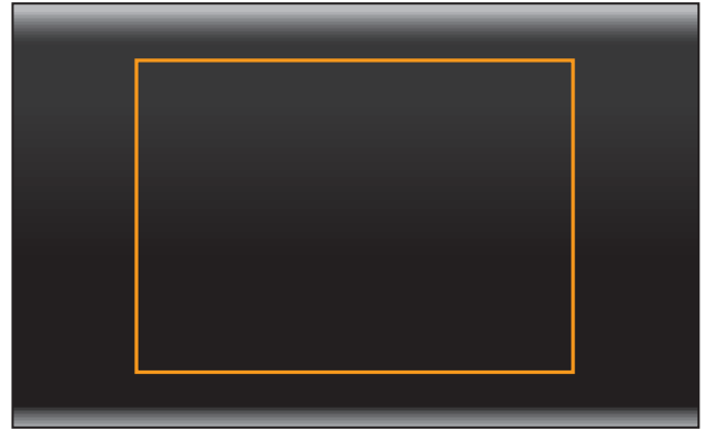
3. + 4. + 7. FRONT SIDE / BACKSIDE