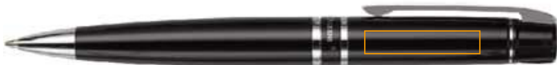
1. NEAR CLIP RIGHT HANDED